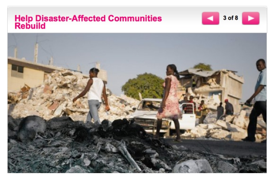
Disasters and the communities affected don't disappear when they are no longer newsworthy. Aid Still Required focuses on raising awareness and rebuilding in the aftermath of natural disasters and humanitarian crises. Visit www.aidstillrequired.org to learn how you can continue to help through donation and action.

We've pulled together some ideas of how you can give back while you have some time off work this week -- and all 2011 long.