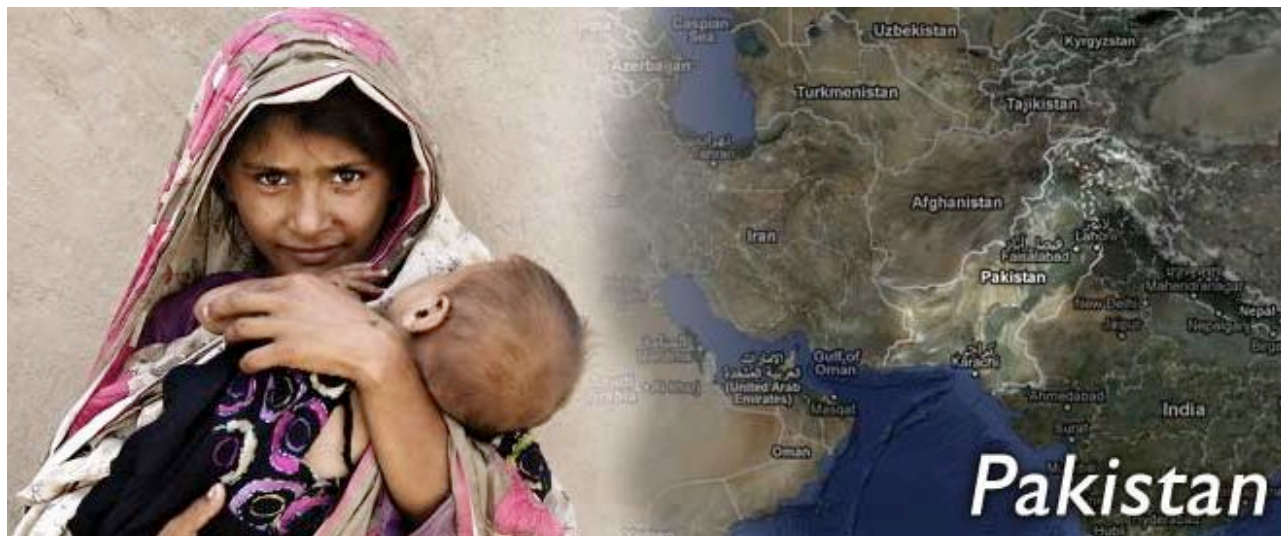
Save the Children saves lives in Pakistan.

Western Union Foundation has donated $50,000 to Save the Children . Save the Children was one of the many institutions represented on the breakfast panel.