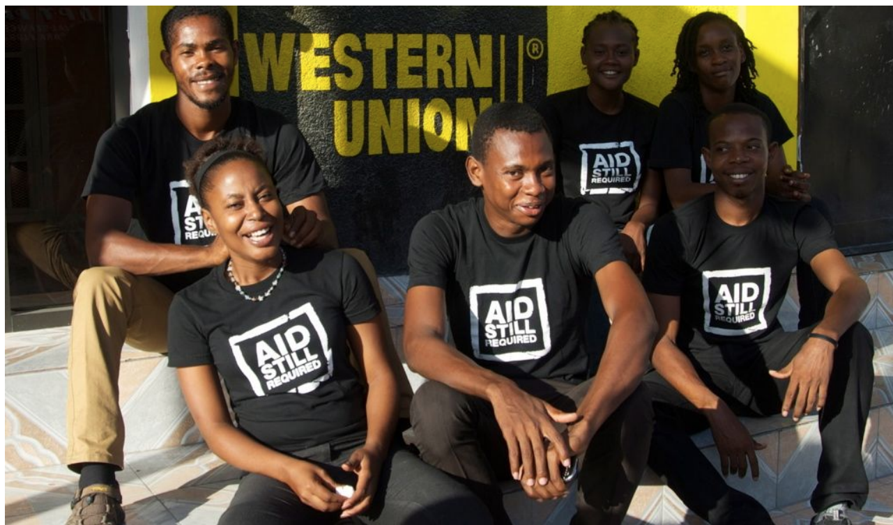
At the CGI in 2012 CGI, Western Union announced a two-year commitment to creating a financial platform, Western Union NGO GlobalPay, which will better connect NGOs and people they serve.

I am a big fan of Western Union, having used it to send funds to our orphanage staff in Indonesia and Sri Lanka after the Tsunami when other companies could not get funds through, and for over a decade in impoverished Haiti. I have experienced how Western Union is not only good for urban areas, but also works well in rural areas such as Bihar, India where last year I met many 'untouchables' ( story ). The focus of this year's breakfast was on mobilizing financial resources for humanitarian and development organizations, particularly in times of crisis and improving financial rapid-response. This critical service, known as NGO Global Pay, was announced at last year's CGI breakfast.